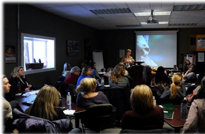
20 Hour Course (January 28, 29 and 30th, 2013)