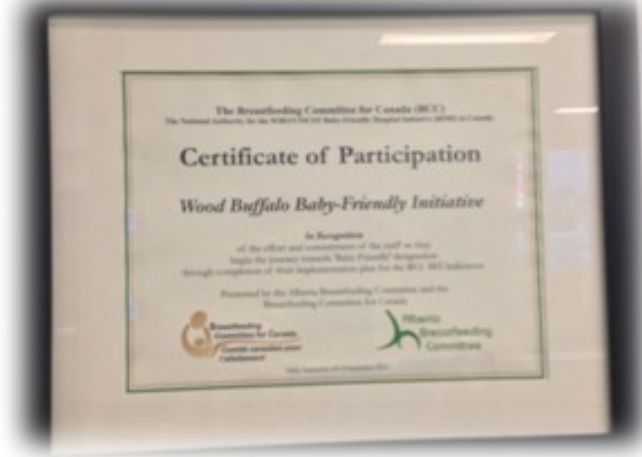
Certificate of Participation awarded by the BCC and ABC

Many achievements have been realized since the initial Baby-Friendly Initiative meeting in April 2012.